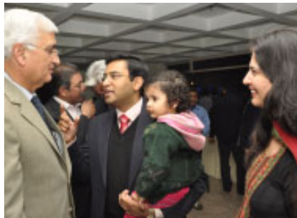
Prof. Saurabh Agarwal with Shri Salman Khurshid, Union Cabinet Minister, Govt of India